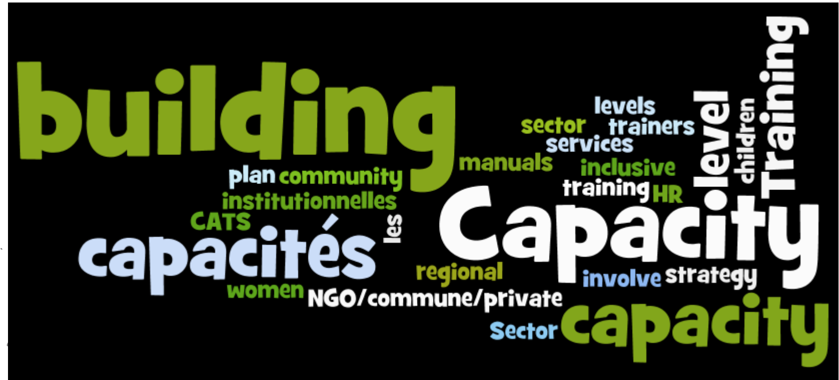
Word-Cloud from country priorities